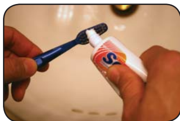
Use desensitizing toothpaste

Now that we've placed your permanent inlay or onlay, it is important to follow these recommendations to ensure its success.