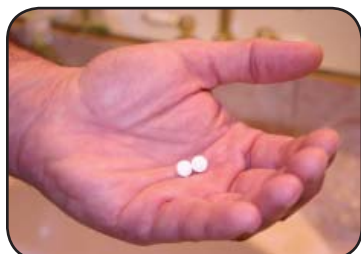
Take medications as instructed